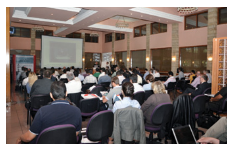
Duratec® Presentation at the Composites Conference

METYX Composites organized and hosted its Second Biennial Composites Summit in Istanbul, Turkey June 1-6, 2009. The six-day summit is the most comprehensive event for high-performance composites in Turkey and amasses industry leaders from across the globe. This year a total of 140 participants and presenters represented 18 different countries.