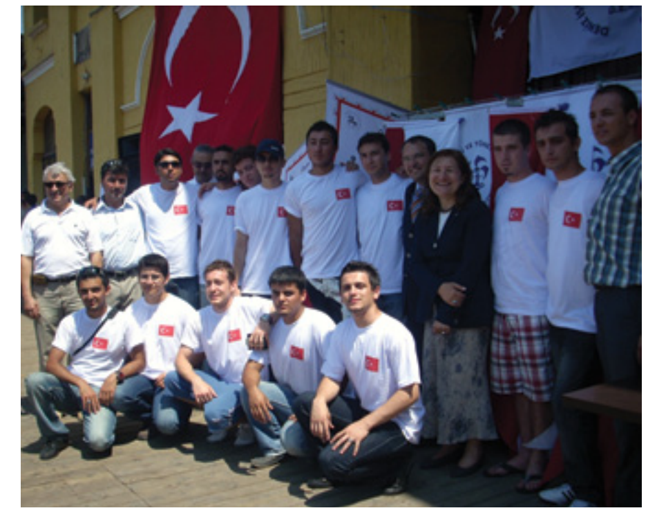
Dokuz Eylul University Solar Powered Boat Team