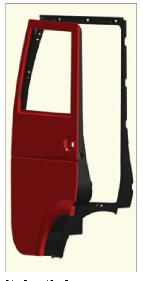
Driver Door and Door Frame

Mr. Asliturk also explained the benefits of RTM stating, "Similar components were never produced by RTM in Turkey. The process yielded measurable results and advantages. For example, the com-