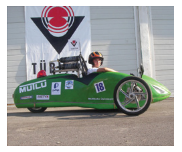
Marmara University Hydrogen Powered Vehicle