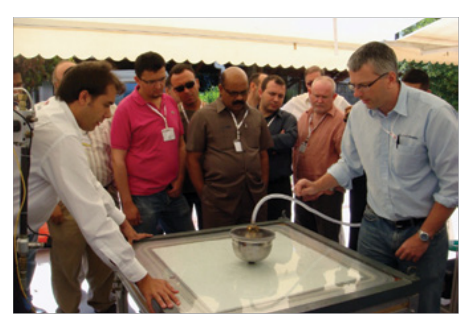
Composite Integration® Demonstration at the RTM School