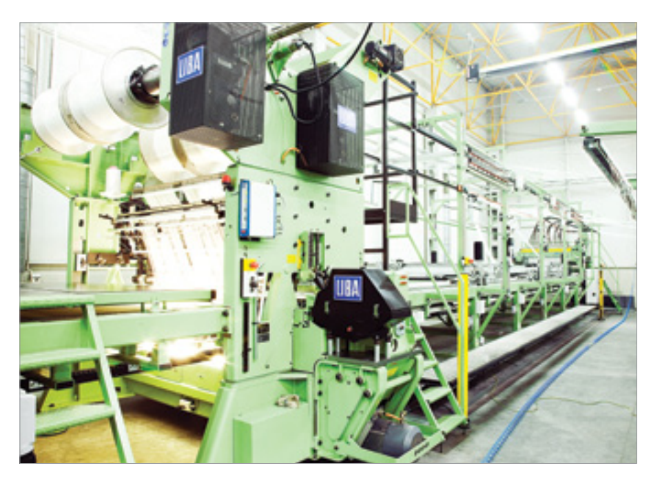
MAX 4 Production Line

Mr. Ustunel continued, "This production line was a significant investment towards our future. Its capacity and capabilities exceed our current needs. However, since every growing sector increases its demands for customized products of consistent and high quality, we are taking a proactive approach so that we are ready in advance. As new players enter the global RTM market, the competition