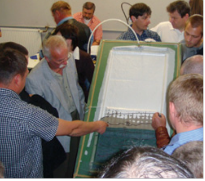
Foam Infusion Demonstration