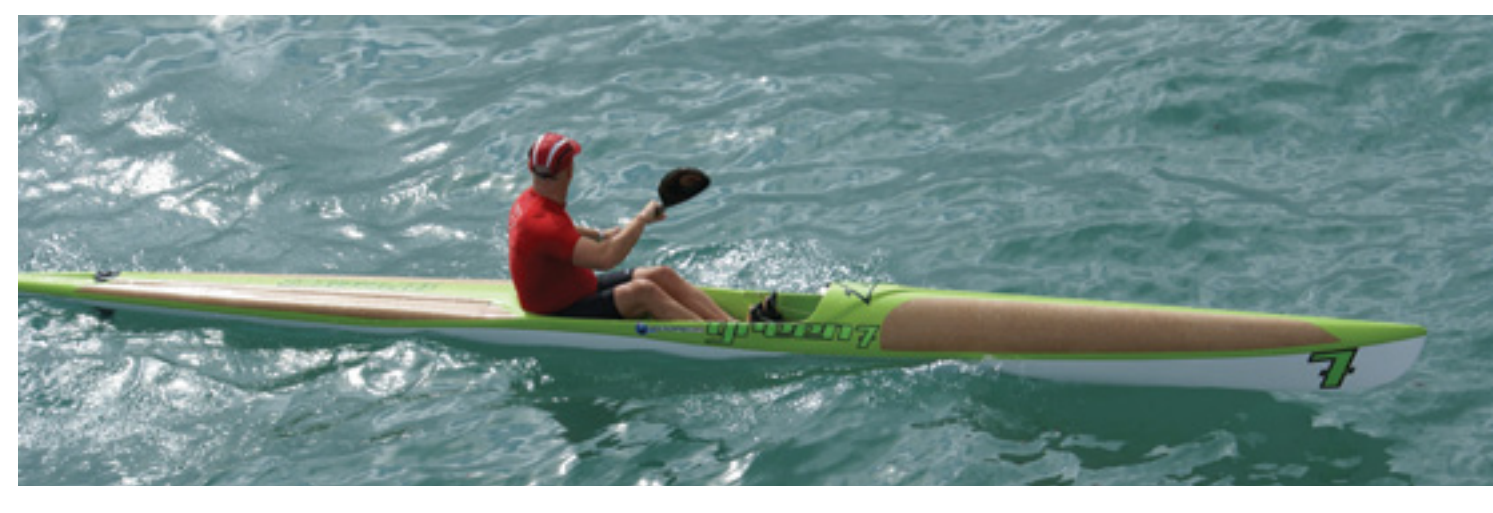
End Products Made with CORECORK

Although the visual look of CORECORK is identical to some other cork products, its composition is completely different. Other cork products are agglomerated with polyurethane based binders (among others) and are made for applications that require only basic mechanical properties with no chemical compatibility. In contrast, with CORECORK, the agglomeration of the selected cork grains is produced under strict control in order to guarantee the total compatibility of CORECORK with all the resins used in this industry (polyester, vinylester, epoxy, phenolics, etc.). Cork granules are ground and sifted in various dimensions, and the density is carefully chosen for each application.