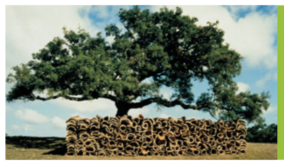
Cork Oak Tree with Stripped Cork Layers