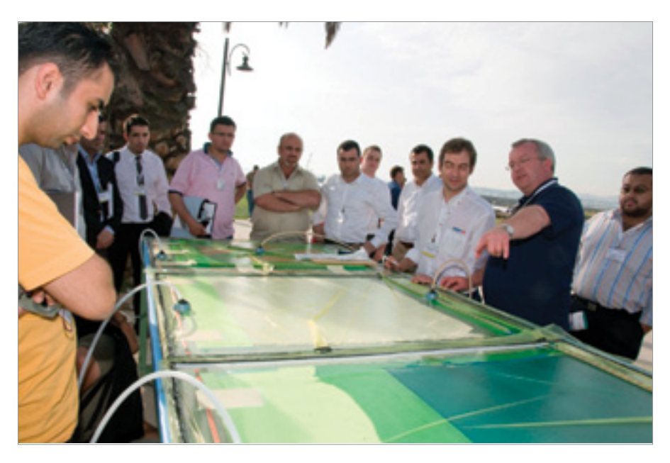
Richmond Aerovac<sup>®</sup> Demonstration at the Composites Conference