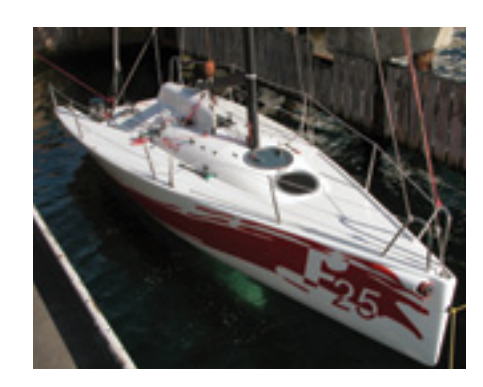
Launch of Farr 25

At 25 feet, Farr 25 is spacious enough to fit two berths with sitting headroom and all required gear. Its low vertical center of gravity and proportional sail area relative to weight make it exceptionally well balanced compared to similar sized boats. The vessel's VPP analysis shows that its performance even matches bigger boats.