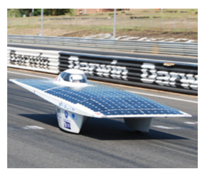
Sakarya University Solar Powered Vehicle